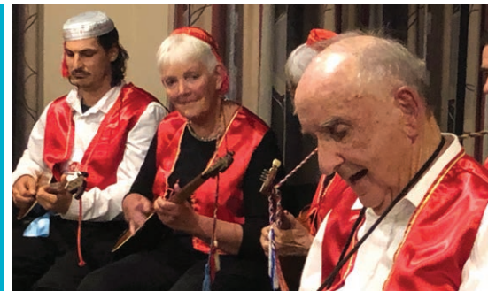
Dargaville Dalmation Cultural Club

We'll look forward to seeing you next time, safe travels everyone.