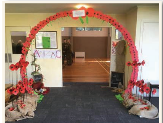
Poppy Arch – poppies made by pupils of Lake Rotoiti School, decorated by ladies from St Arnaud Branch.